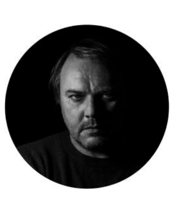
Francesco Zizola (IT)